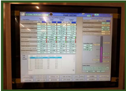
SCADA application secured by CyberLock