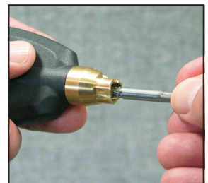
Figure 3 - Place retracted BRUSH on pins and twist