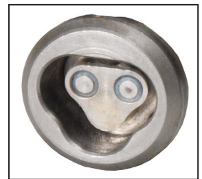
Figure 1 - Dirty Lock Face