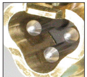
Figure 4 - Clean pins